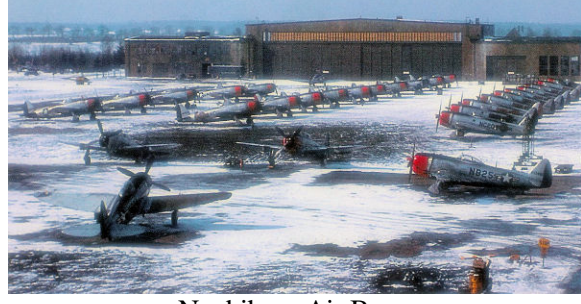
Neubiberg Air Base

July to 25 August 1947, the group also exercised operational control over a P-51 Mustang squadron (later, Detachment A, 86th Composite Group).