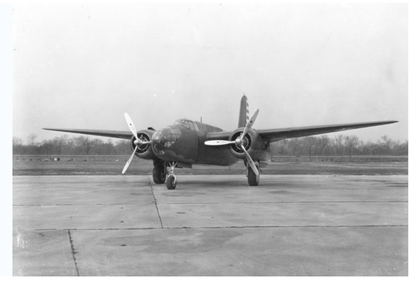
Douglas A-20 Havoc

activated on 10 February 1942 at Will Rogers Field, Oklahoma, with a cadre of five officers and 163 enlisted men, and made several moves before settling at Key Field in Meridian, Mississippi. In Mississippi it began training on A-20 and DB-7 Havoc aircraft.