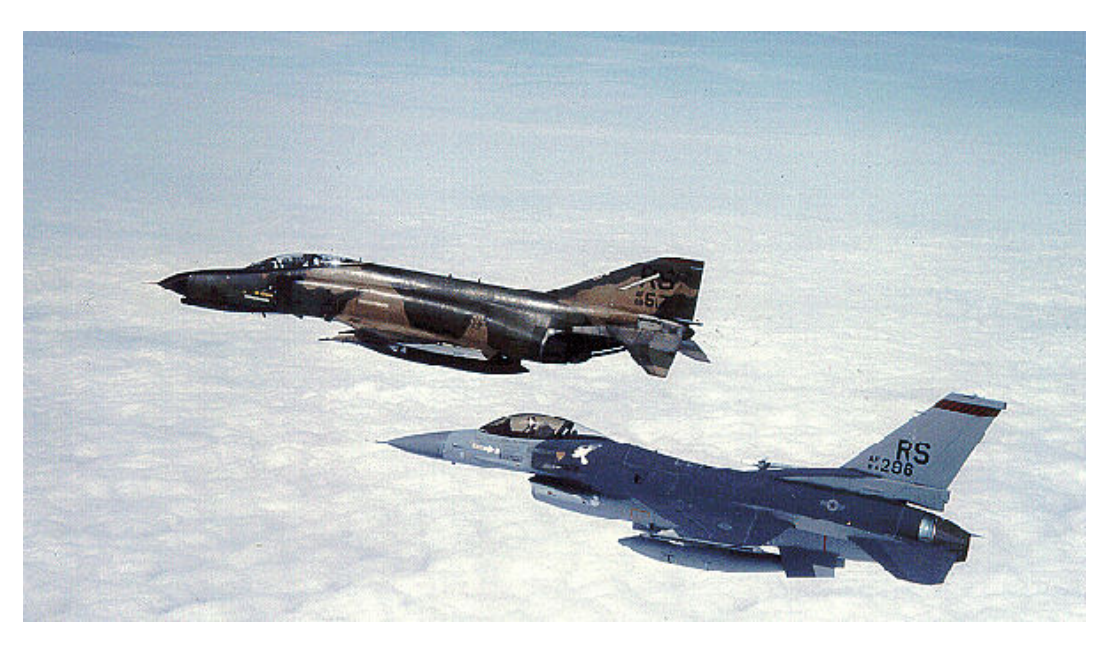
Changing of the Guard: the F-4E (top) to the F-16C (bottom), 1986