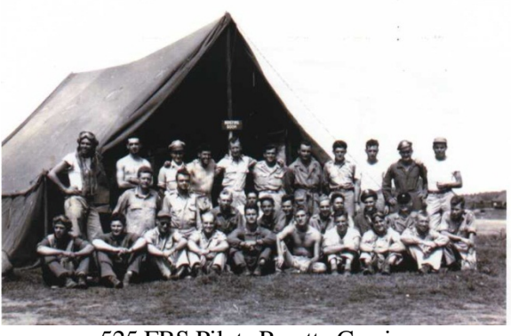
525 FBS Pilots Poretta Corsica

southern France (15 August 1944). The Allied forces met little resistance as they moved 20 miles inland in the first twenty-four hours. The 86th attacked German units on enemy road and rail networks in northern Italy and southern France and, for the first time, flew regular escort missions for heavy bombers.