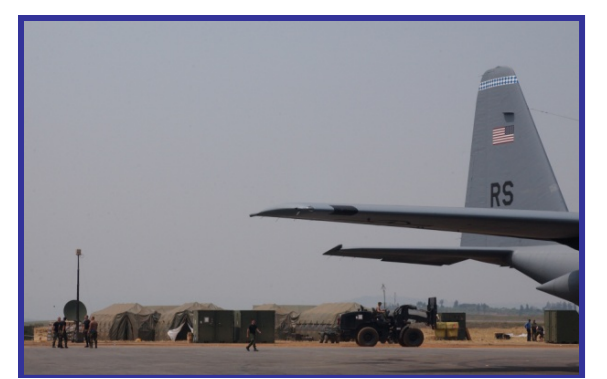
37 AS C-130E Supporting Humanitarian Operations

During ATLAS RESPONSE, a new capability was provided by a 37 AS C-130E, serial number 68-0938. It was the first USAF C-130 to be equipped with the Keen Sage camera system. This system was mounted in a metal-encased sphere, slightly larger than a basketball. It housed three sophisticated video capture lenses, a daylight television, a 955mm fixed focal length zoom and infrared in six fields. Two operators performed airborne sensor operations from a pallet workstation which was strapped down in the cargo hold of the Hercules. The lenses scanned full circle and along 90 degrees of elevation. The airborne camera operators could beam live analog video and digitallycaptured still images back to a ground station, where it could be recorded and sent to relief organizations and other users.