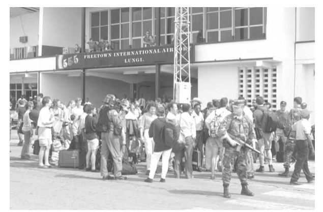
US Citizens Awaiting Evacuation from Liberia during Assured Response

missions and evacuated 625 Americans and foreign nationals.