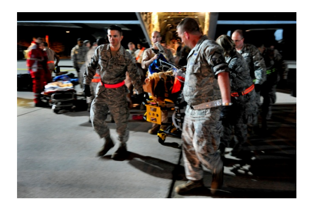
Airmen from the 86th Aeromedical Evacuation Squadron and a Critical Care Air Transport Team from Landstuhl Regional Medical Center unload wounded Libyan fighters from a C-130J Hercules .

On 29 October, the AW supported international humanitarian relief efforts in Libya at the request of the Department of State and by direction of the Secretary of Defense, USAFRICOM. The 86 AW transported four wounded Libyans to Ramstein for treatment in medical facilities in Europe and 28 for further transportation and to and treatment in the United States.