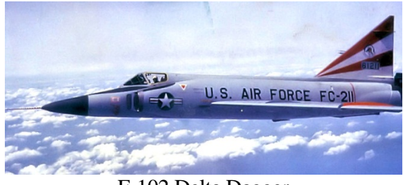
F-102 Delta Dagger

Headquarters Seventeenth Air Force moved from Wheelus AB, Libya to Ramstein on 15 November 1959, and that same year the 86 FIW wing converted F-102A Delta Daggers .