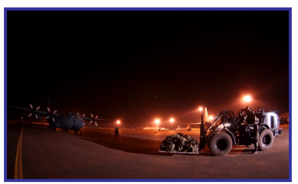
CRG "Opening the Base" Operations

Squadron. Moreover the 86 CRG incorporated more than 30 different jobs. This new self-contained element became the Air Force standard for such units, and proved its utility during the Kosovo conflict.