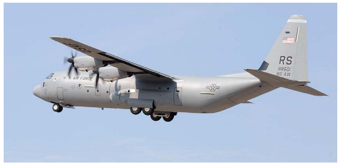
C-130J Super Hercules

2010 witnessed a good deal of activity. The 86th played a role in Operation ENDURING FREEDOM supporting the Commander of the International Security Assistance Force in Afghanistan. The 86th AW also continued with partnership building in places such as Bulgaria, Rumania, and Poland. From 4 to 7 December, Two C-130J Super Hercules aircraft assigned to the 37th Airlift Squadron at Ramstein Air Base, Germany, delivered 65 tons of fire retardant This was part of a joint U.S. to Israel. European Command and U.S. Air Forces in Europe effort to assist the Israeli government deal with what was considered the worst wildfire since the country's founding in 1948.