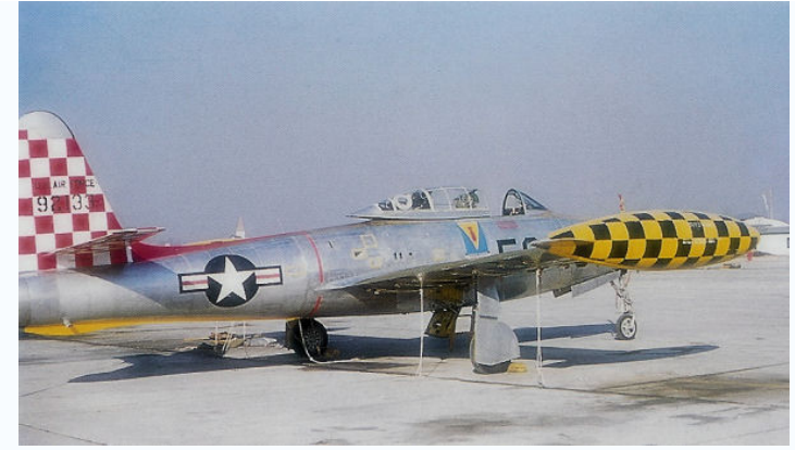
Republic F-84E Thunderjet of the 527 Fighter-Bomber Squadron, 86 FBW

In the wake of the increasing conventional forces in Europe military leaders decided to construct six new bases west of the Rhine. One base, or rather two adjoining bases, Landstuhl and Ramstein were built on an auxiliary Luftwaffe landing strip on a portion of the uncompleted autobahn between Landstuhl and Ramstein, near Kaiserslautern.