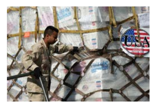
86 AW Personnel Supporting Provide Hope

WATCH and SOUTHERN WATCH, as well as PHOENIX SCORPION I-IV, the deployment of forces as a show of force to compel Iraq to comply with UN weapons inspectors. The PHOENIX SCORPION deployments provided the means for later coercive air strikes against Iraq. From 1998 through 2000, 86 AW personnel supported Operation PROVIDE HOPE under which excess medical supplies were delivered to the Republic of Moldova in the former Soviet Union.