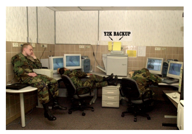
Communications Personnel waiting for the Y2K crash which never happened