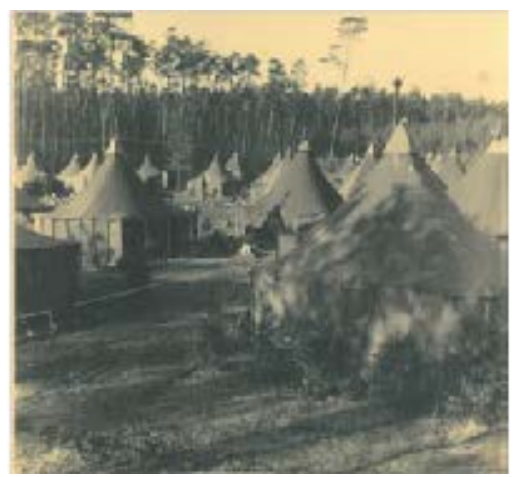
Temporary quarters at Landstuhl

On 17 February 1952, Detachment 1, Headquarters 86th Fighter-Bomber Wing, under the command of Lieutenant Colonel Clyde M. Burwell arrived at, what was to become, Landstuhl Air Base (AB) to supervise the construction of the facilities on what consisted of the Ramstein flight line and facilities south of Kisling Memorial Drive. An immediate priority was to construct security fencing for the accompanying aircraft of the advanced party.