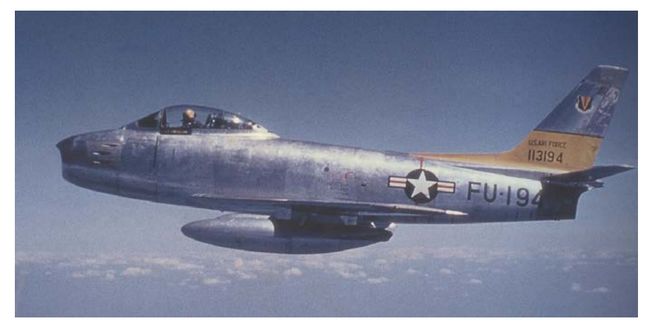
F-86F Sabre of the 527 Fighter Bomber Squadron, 86 FBW (insignia at the top of the tail)

during missions were unable to return to the airfield at Tantonville or Braunshardt and crashed or made forced landings in Rheinland-Pfalz or just east of the Rhein in Hessen and Baden-Wuertemberg. Moreover the last war time headquarters of the 86 FBG was only an hour away at Braunshardt near Gross Gerau.