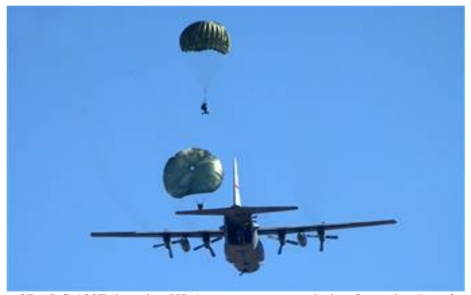
37 AS C-130E dropping US Army paratroopers during Operation Rapid Guardian

This was a peacekeeping operation in Kosovo designed to establish a secure environment for the return of the refugees. The 86 AW also executed the first combat airdrop into Kosovo, during Operation RAPID GUARDIAN, when it flew seven sorties for the U.S. Army and dropped approximately 130 US Army Paratroopers.