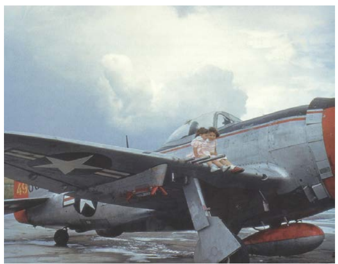
The Last P-47