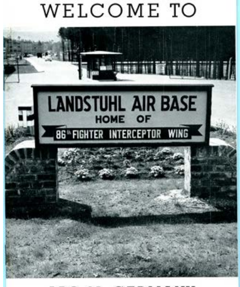
APO 65, GERMANY

On 23 Mar 1953, The Air Force used the 86 FBW for "service test" reorganization and changed the wing's structure from four groups to two groups, one combat and one support. The purpose of the test was to determine the maximum efficiency obtainable with the minimum of personnel.