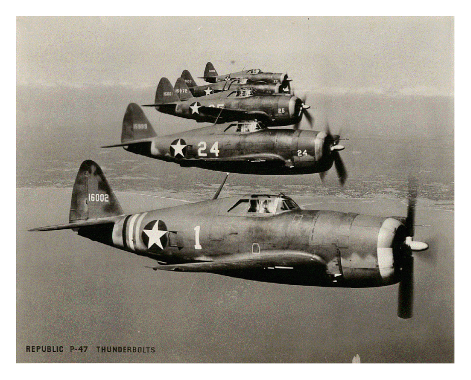
Flight of P-47 Thunderbolts

On 2 July the 86 FBG, along with other units of the 87 FW, participated in Operation MALLORY MAJOR. In just over 72 hours the over 22 bridges spanning the Po River were either damaged or destroyed. The Supreme Allied Commander, Western Europe, lauded this performance stating that he regarded "this feat as being outstanding in the history of Air War Fare," and that the Group's efforts would "have far reaching effects on the progress of this campaign in this Theater."