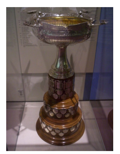
The Mackay Trophy

On 12 October 2000 the US Navy destroyer USS Cole was attacked, while refueling at the port at Aden, Yemen, by terrorists. The latter pulled up close to the Cole in a small boat and detonated a bomb, which opened a 40 by 40 foot hole on its port side. The explosion killed 17 sailors and wounded 40 others. The Wing's 86 AES and 37 AS evacuated the 28 injured sailors (9 litter and 19 ambulatory) from Yemen to Landstuhl Regional Medical Center for immediate lifesaving medical care. Both squadrons were recognized for their meritorious mission. The National Aeronautics Association chose the two squadrons to share the Mackay Trophy for performing heroic rescue efforts in record time for victims of the USS Cole tragedy during the 6,000 mile round-trip journey between Aden, Yemen, Djibouti, Africa and Ramstein, Germany. Aircrew members responded brilliantly and launched two rescue C-9 crews within one hour of alert.