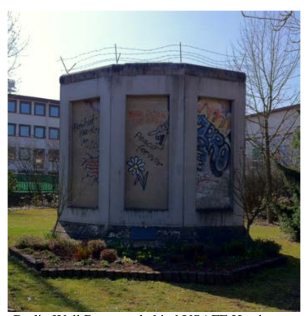
Berlin Wall Remnant behind USAFE Headquarters

its waning days and questions about the future of US forces in Europe began to arise. The exuberance displayed in those halcyon days of the winter of '89 was soon overshadowed by events in the Middle East.