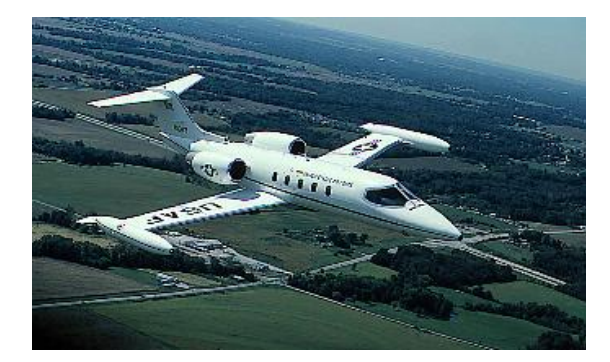
C-21 Lear Jet

On 1 July 1993 Detachment 1, 435th Operations Group, at Chievres, Belgium was redesignated as the Det 1, 86th Operations Group, bringing a C 9A into the 86th inventory and along with it the responsibility to provide direct airlift support to Supreme Allied Commander Europe (SACEUR).