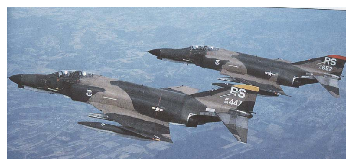
F-4Es of the 86 TFW