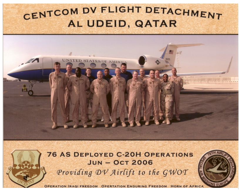
76 AS/86 AW C-20H Deployed Crew

On 2 February; the 86 CRG sent a team to Chad, Africa to help USAID with ongoing humanitarian operations.